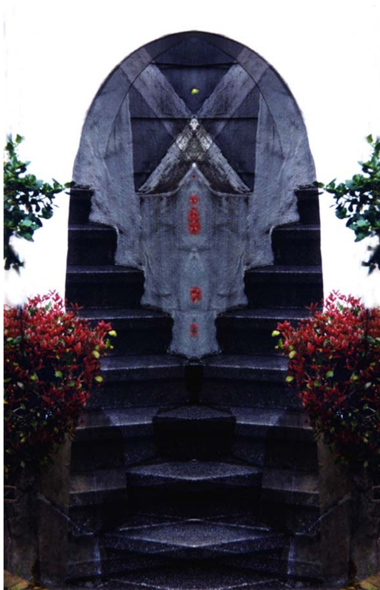
Descent of Esoterica Divinica.