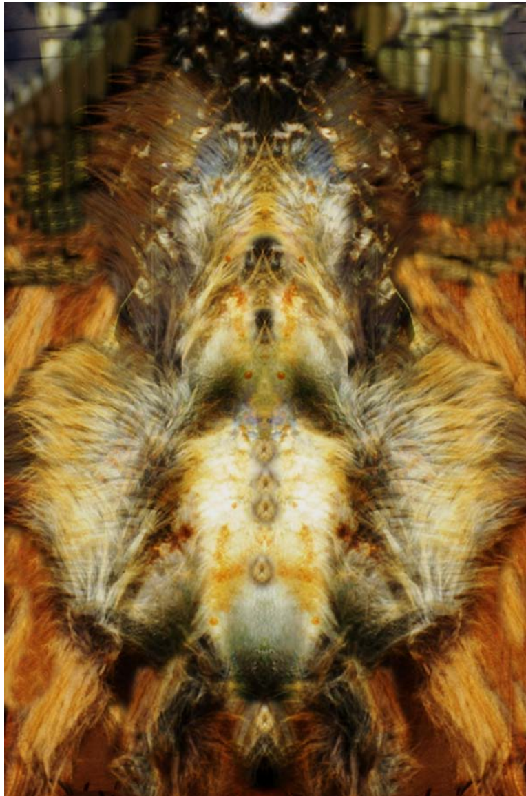
To the Core.